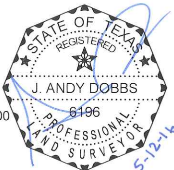
EXHIBIT A 0.053 ACRES OUT OF MALACHI TUCKER SURVEY, ABSTRACT NO. 904 COLLIN COUNTY, TEXAS

J. ANDY DOBBS REGISTERED PROFESSIONAL LAND SURVEYOR NO. 6196 12750 MERIT DRIVE, SUITE 1000 DALLAS, TEXAS 75251 PH. 972-770-1300 andy.dobbs@kimley-horn.com