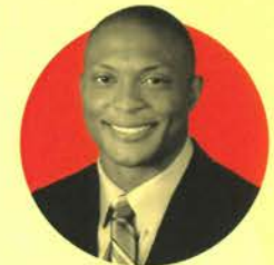
Eddie George NFL Legend, Entrepreneur and Renaissance Man

Full schedule available online at www.NACo.org/Annual