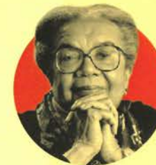
Marian Wright Edelman Founder and President, Children's Defense Fund