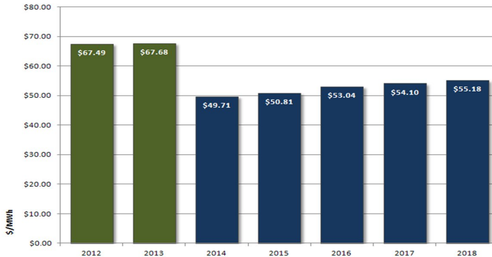
ERCOT Supplier Costs, Calendar Contracts

Estimated future electricity market rates indicate an attractive range of potential savings: