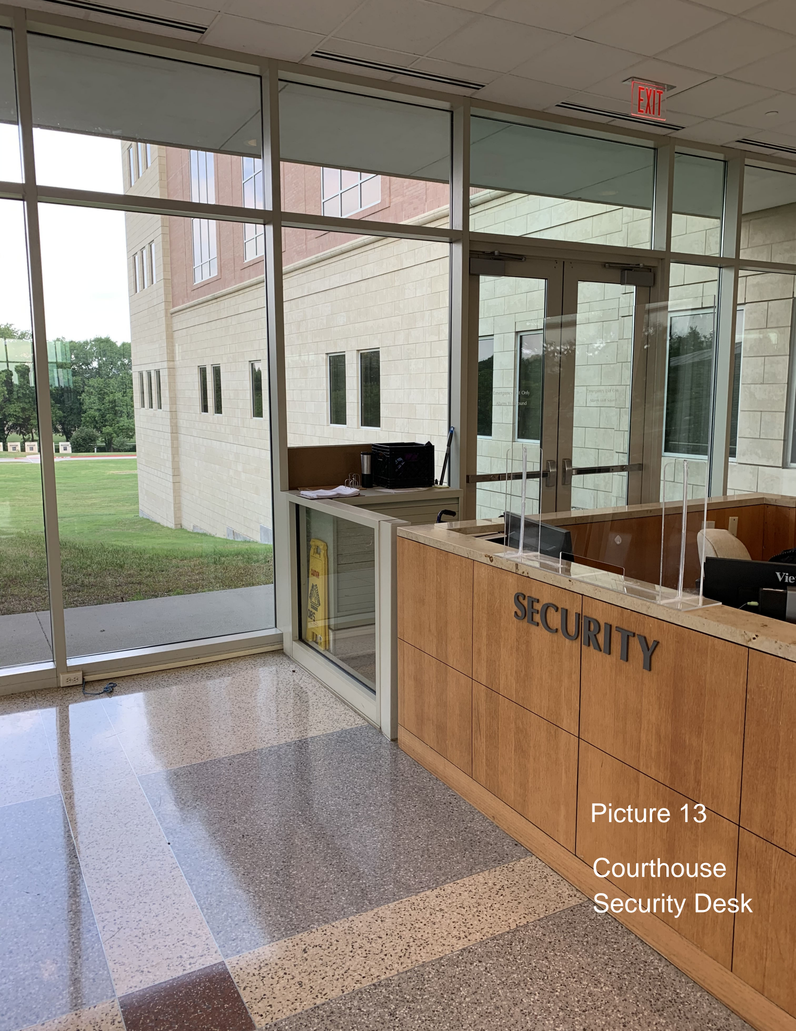
Picture 13 Courthouse Security Desk