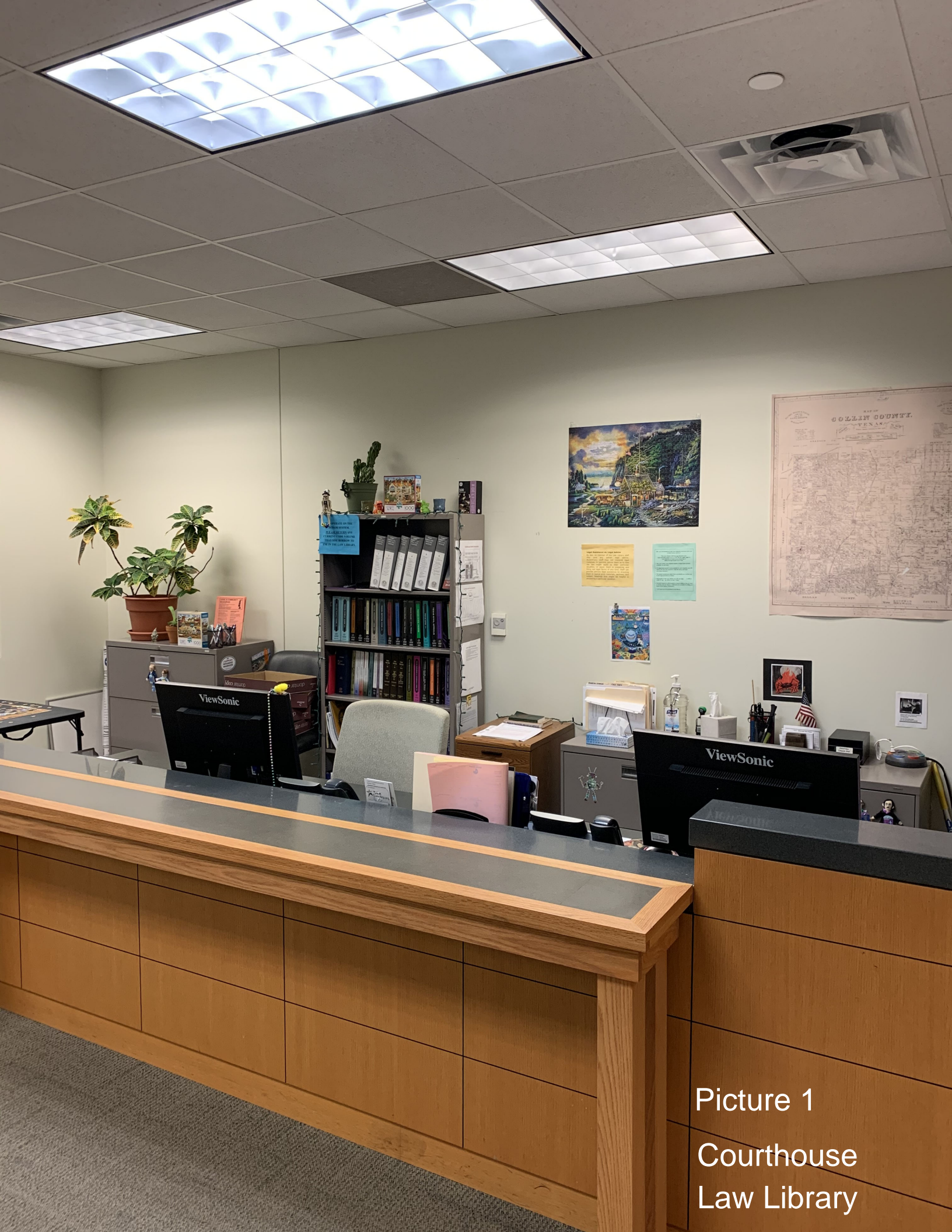
Picture 1 Courthouse Law Library