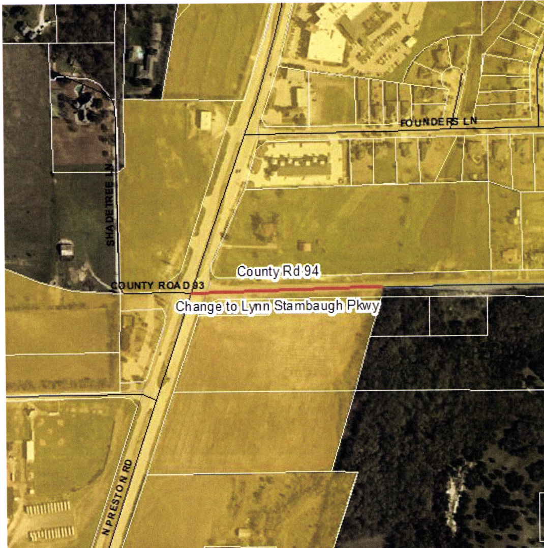
Exhibit "A" Proposed County Road 94 Renaming Limits