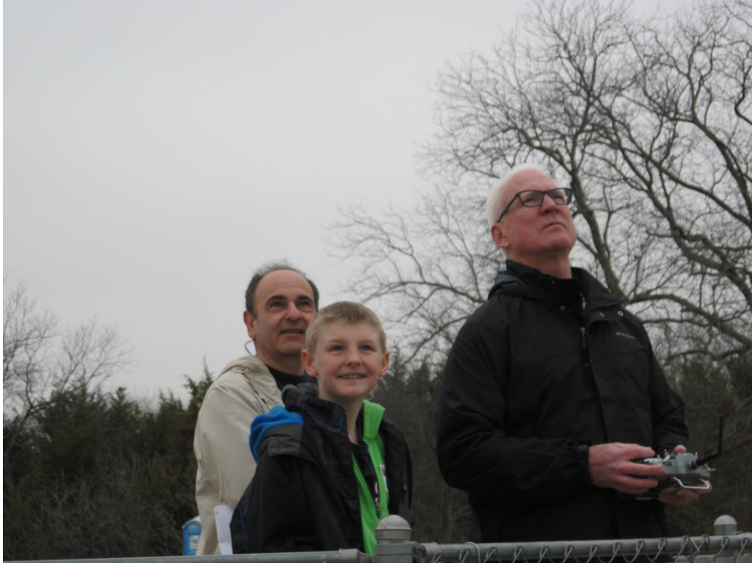
Instructor and Student with Buddy Box