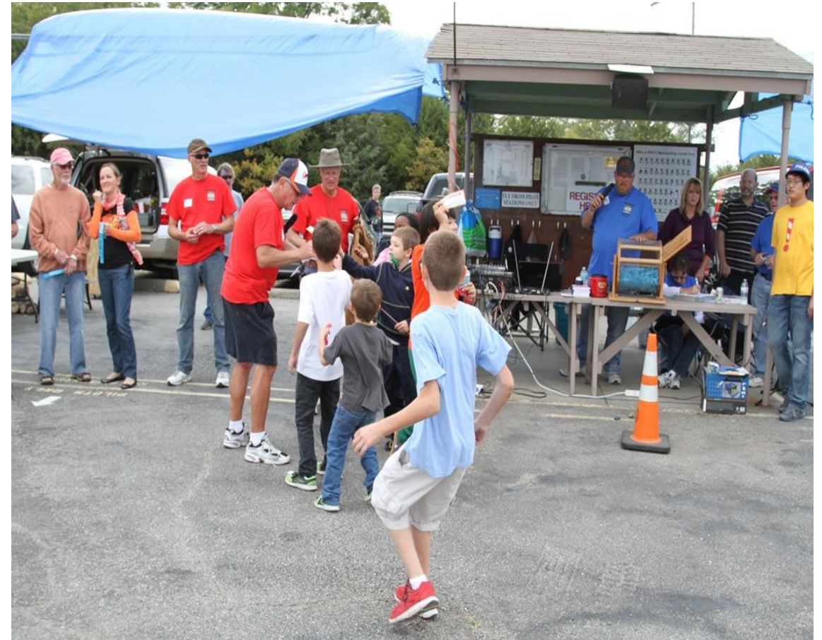
Southwest Aero Modeling Convention