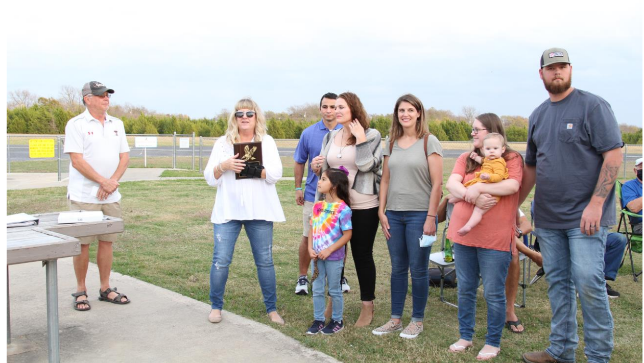
At the Field