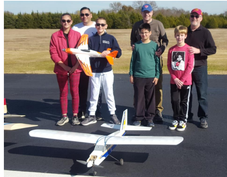
EAA Program Build Project and Visitors

Other programs: McKinney High School Aviation Academy, Plano Academy STEM Program, Young Eagles – EAA at McKinney Airport,