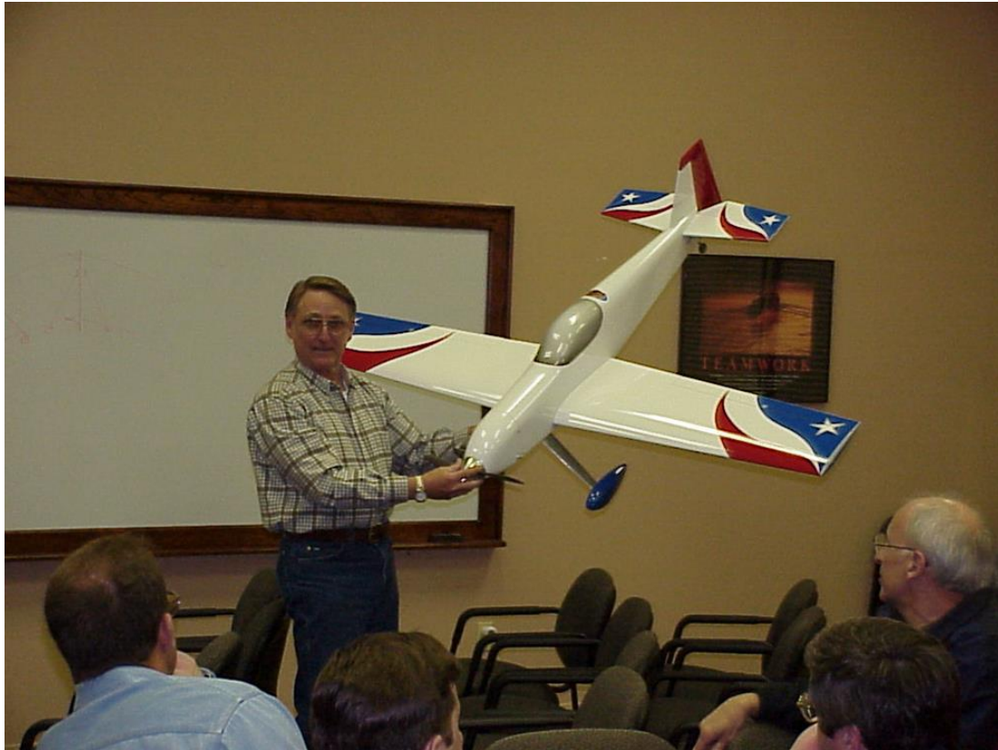
At Allen City Facilities