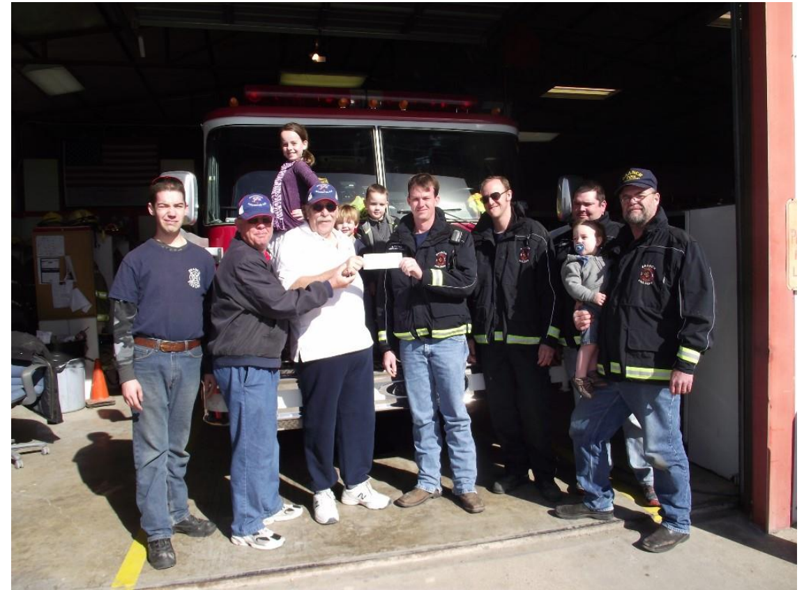
Branch Fire Department Donation