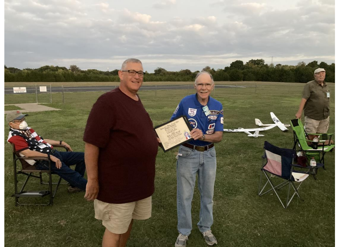
New Pilot Graduation and Certificate