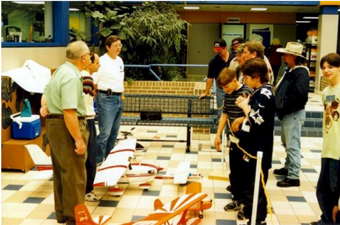
Bowman Middle School RC Aircraft Demonstration