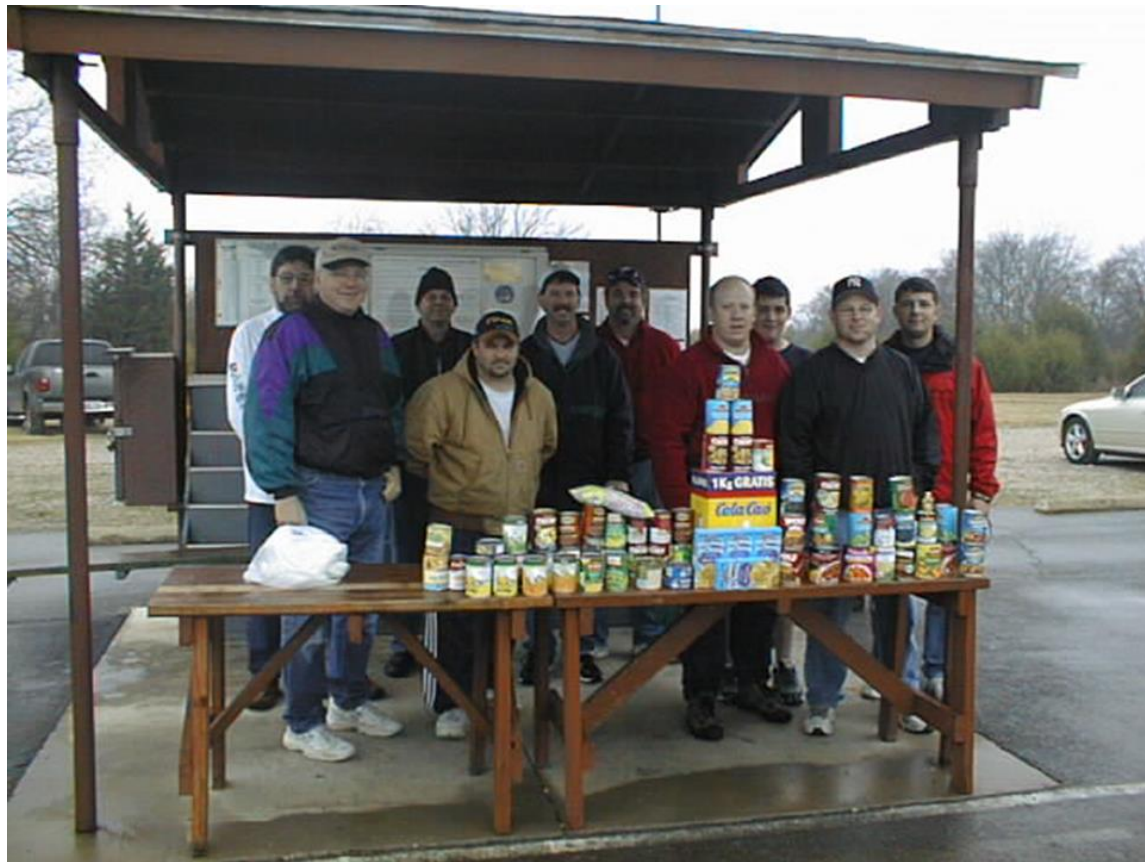
Fun Fly Allen Community Outreach Donation