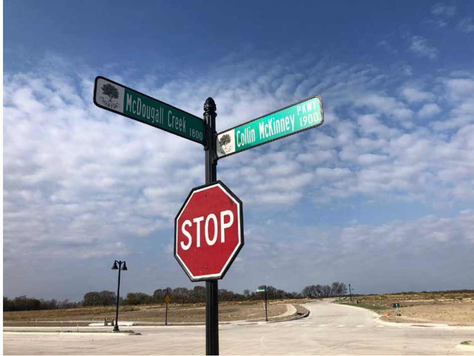
Street signs installed