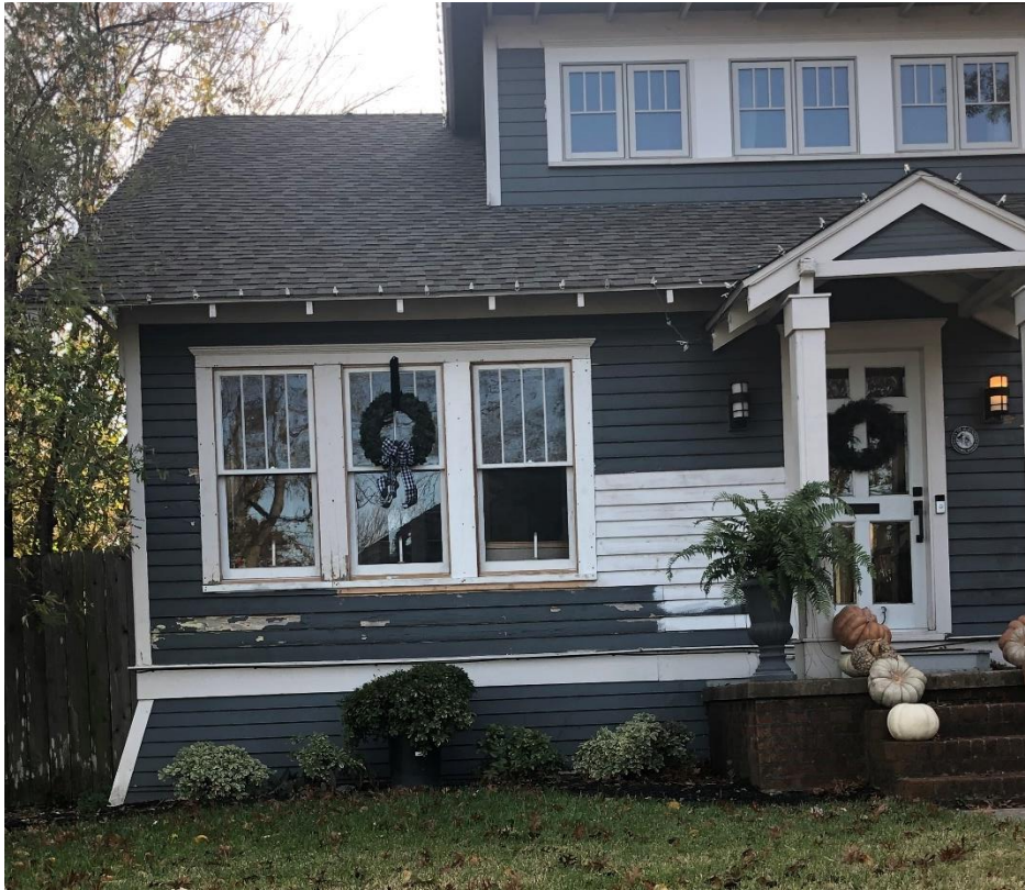
7. Walter Allen House