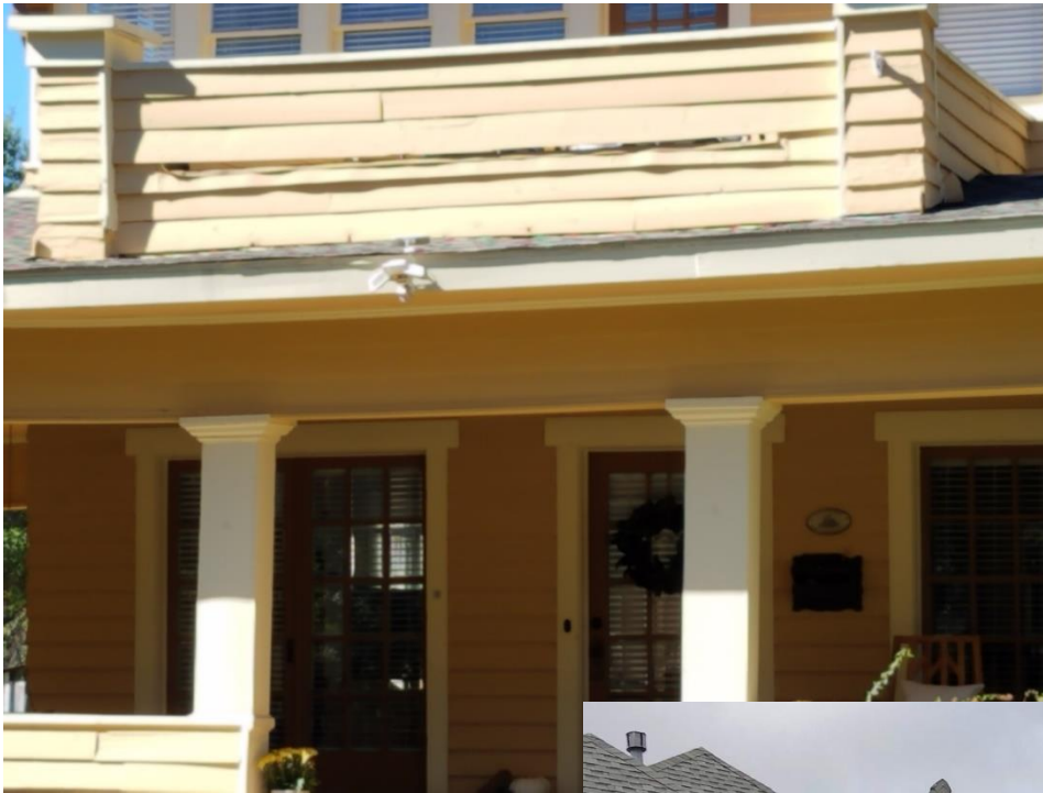
10. Wall-Robins House –

1813 Ave K, Plano Rotten wood, peeling paint, neglect, 2 nd year