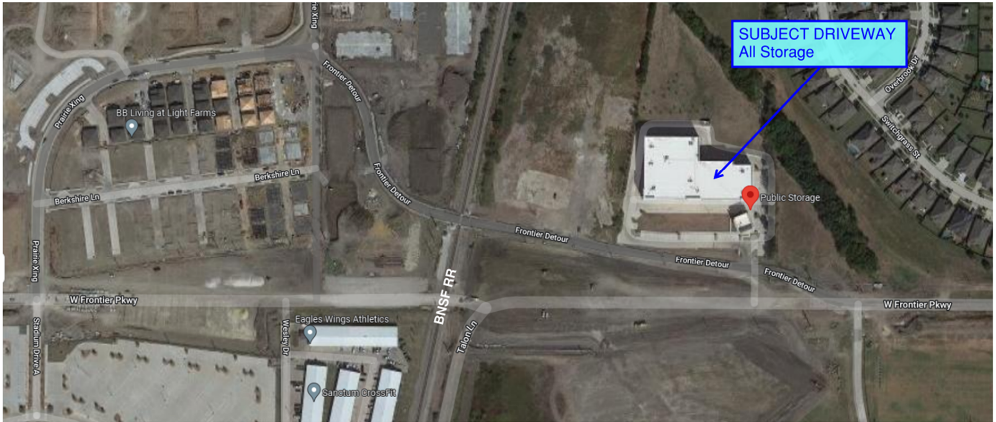
EXHIBIT A All Storage Driveway Shift General Project Location