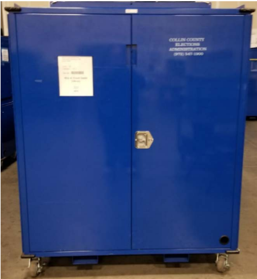
ILLUSTRATION 1 Carrier Cabinet