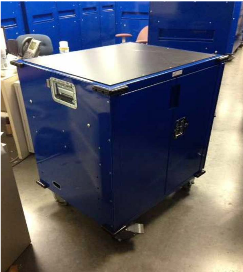
ILLUSTRATION 2 Work Station Cabinet