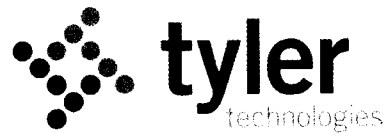
Exhibit 1 Investment Summary

The following Investment Summary details the software and services to be delivered by us to you under the Agreement. This Investment Summary is effective as of the Effective Date. Capitalized terms not otherwise defined will have the meaning assigned to such terms in the Agreement.