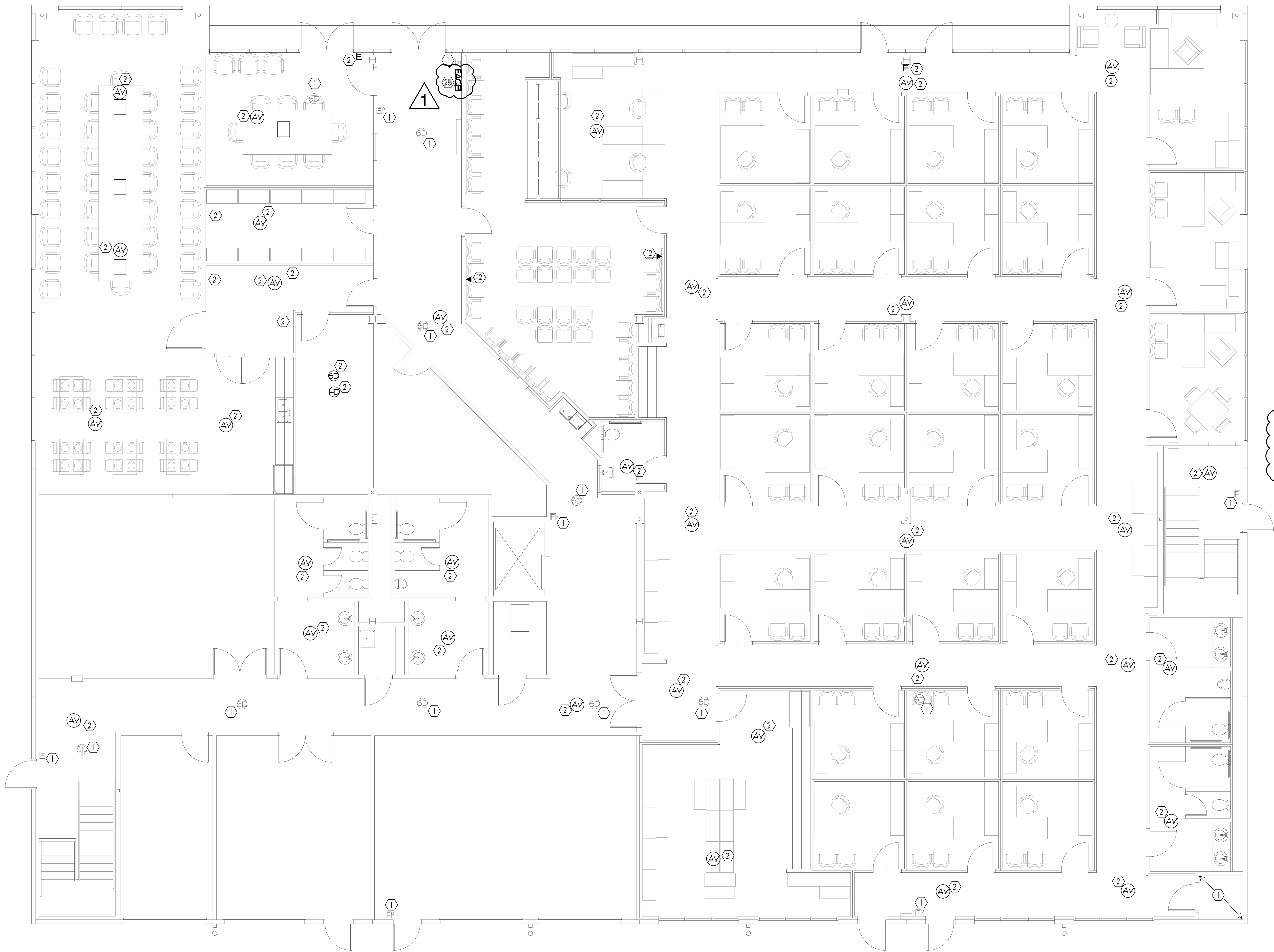
1 FIRE PROTECTION PLAN SCALE: 3/16" = 1'-0"